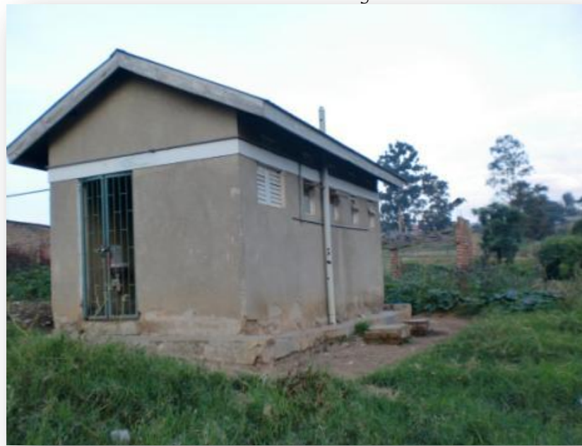
FIGURE 3: A TYPICAL TOILET FOUND IN THE SETTLEMENT