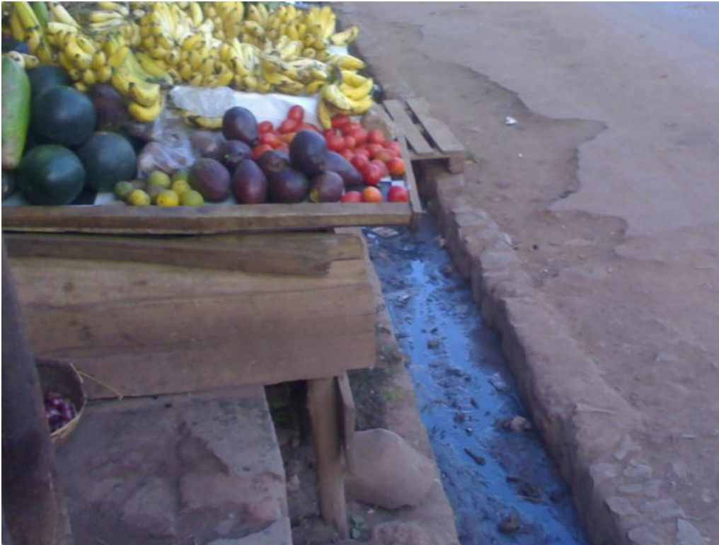
FIGURE 1: SELLING FRESH VEGETABLES, ONE OF THE ECONOMIC ACTIVITIES IN THE SETTLEMENT