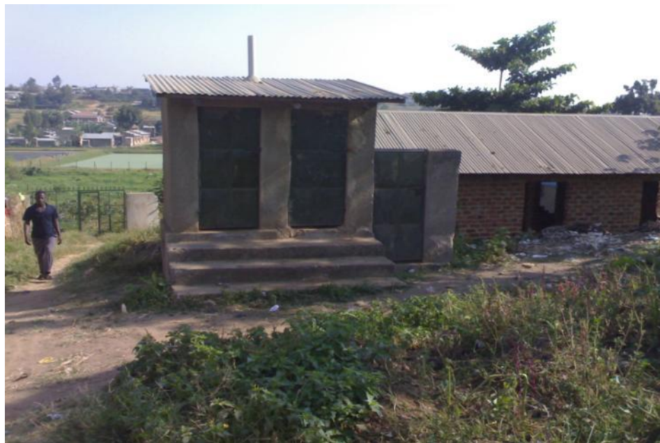
FIGURE 7: ONE OF THE FEW TOILETS IN THE SETTLEMENT