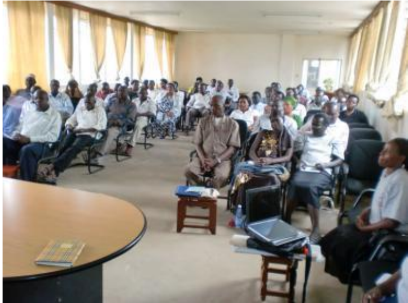
First meeting with the councillors, LCs and municipal council at Mbarara municipal offices

The profiling team then met with the LCs and councillors to identify the local teams to work with the slum dwellers federation during the exercise.