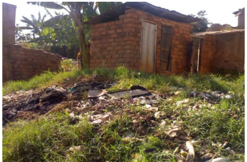
FIGURE 5: A TYPICAL TOILET FOUND IN THIS SETTLEMENT