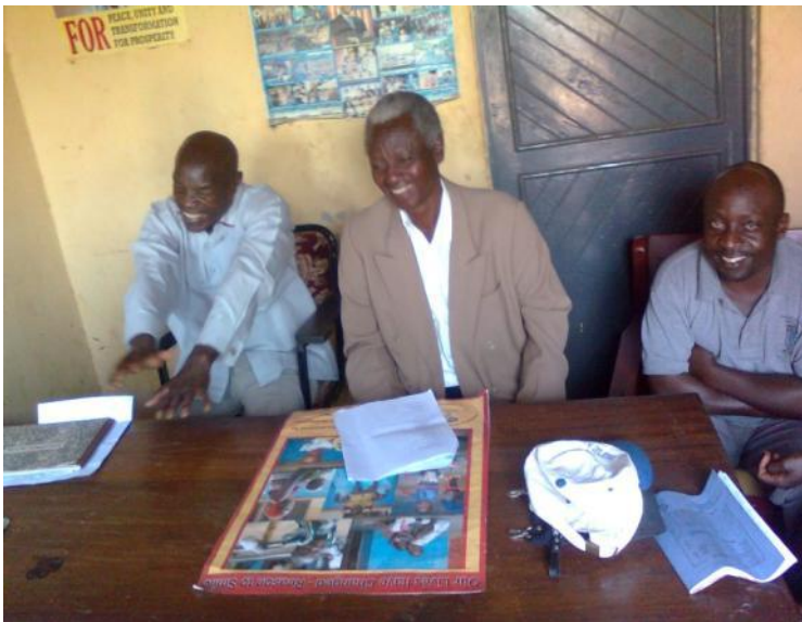
Opinion leaders in focused group discussion

Training of the local teams is done to ensure that the information gathered during the profiling exercise is accurate and can be used as a basis for planning.