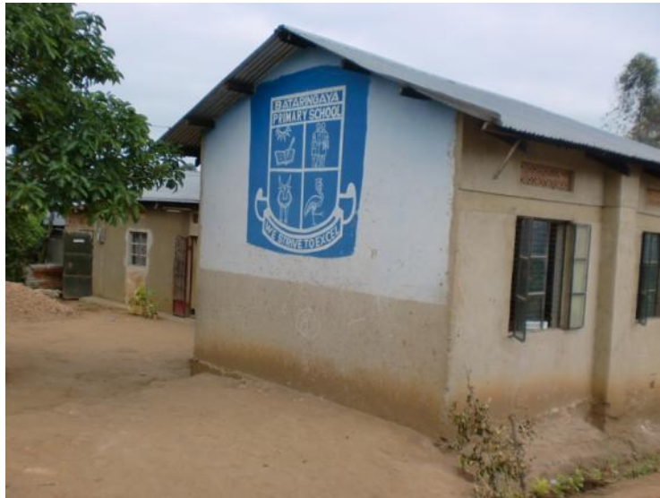
FIGURE 2: THIS SCHOOL PROVIDES EDUCATION SERVICES TO OVER 50% OF THE CHILDREN IN KISENYI