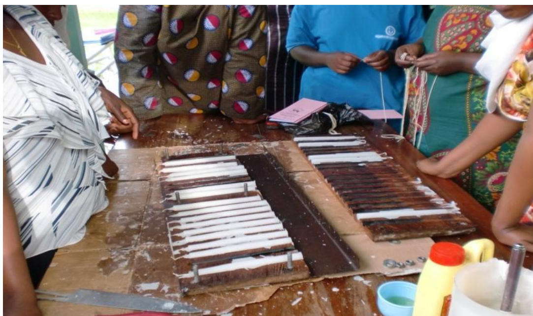
FIGURE 4: WOMEN MAKING CANDLES FOR SALE AS A SOURCE OF INCOME