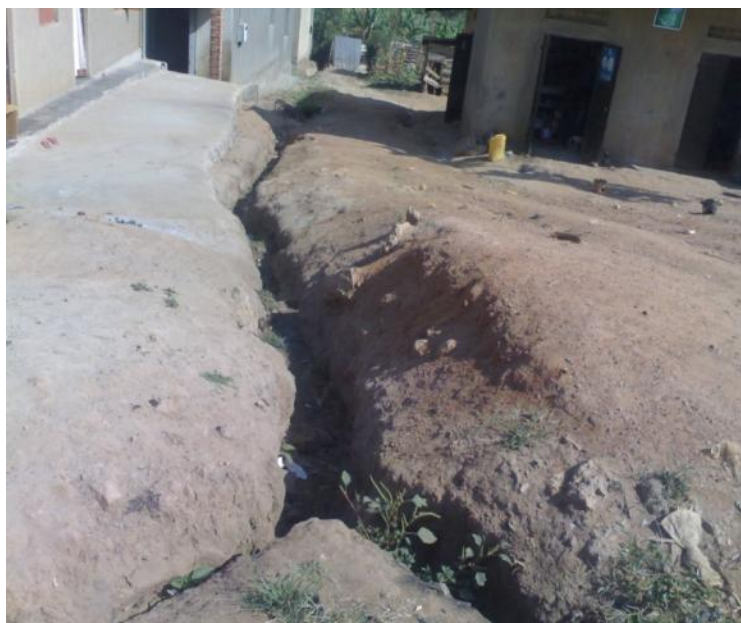
FIGURE 8: AN EXAMPLE OF THE DRAINAGE CHANNELS IN THE REGION