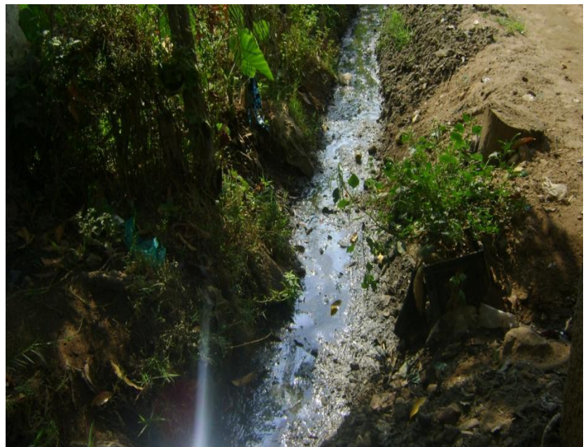
FIGURE 9: A POORLY MAINTAINED DRAINAGE CHANNELS