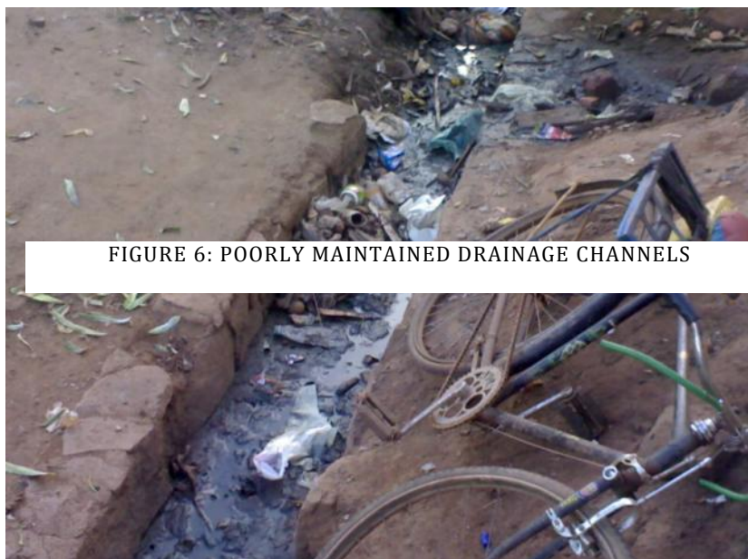
FIGURE 6: POORLY MAINTAINED DRAINAGE CHANNELS