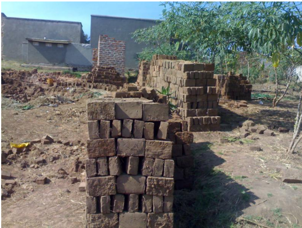
FIGURE 10: BRICK-LAYING, ONE OF THE ECONOMIC ACTIVITIES CARRIED BY RESIDENTS OF THIS SETTLEMENT